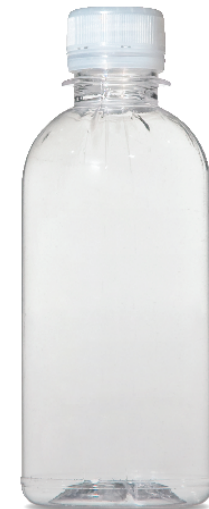
8 oz Smooth Bottle RB-101