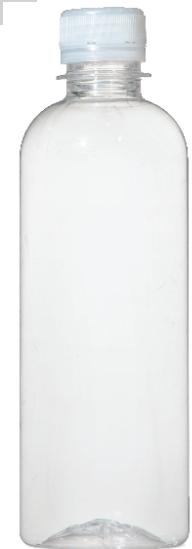
12 oz Smooth Bottle RB-201

Font Size - Standard fonts smaller than 7 pts should be done in black ink. If a CMYK font is part of the graphic and is smaller than 7 pts, color registration variation MAY BE VISIBLE. Important: very 'thin fonts' done in CMYK are the most susceptible to registration visibility.