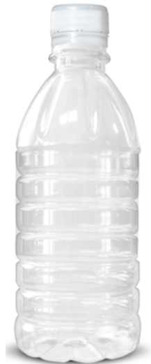
12 oz Ribbed RB-202