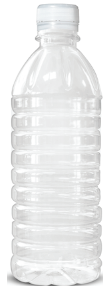
16.9 oz Ribbed RB-302